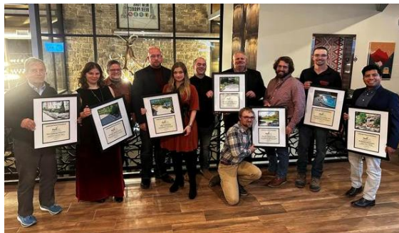
2024 Landscape Award Recipients

Feature Focus - enter based on specific aspect of the garden – lighting, water, etc.