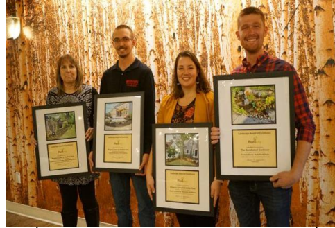
2023 Landscape Award Recipients

Feature Focus - enter based on specific aspect of the garden – lighting, water, etc.